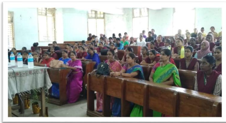
Alumni as jury